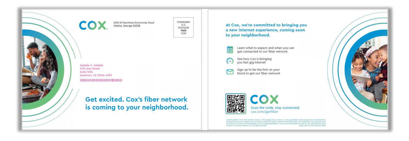
"We're Coming" 1:1 Direct Mail Postcard (English and Bilingual available)