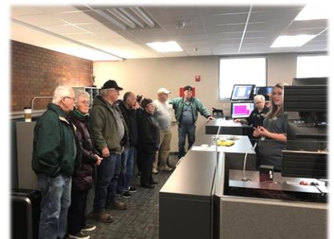
York County new 911 Center

The communications center with its upgraded technology is located within the Sheriff’s office inside the new addition.