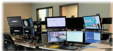
York Emergency Communications Center