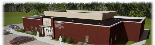
Grand Island-Hall County Emergency Management & Communications Center

In York County, a recently completed expansion of the York County Courthouse, is the new home of the York Police Department & York County Emergency Communications Center. The new addition with a cost of two million dollars is designed to withstand an F5 tornado.