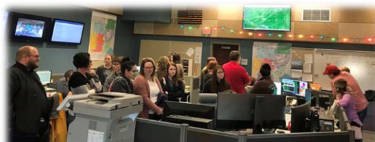
Class participants tour new Grand Island- Hall County Emergency Management & Communications Center