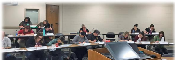
Basic Public Safety Telecommunicator Training Course NE Law Enforcement Training Center

The PSC state 911 department would expect to hold additional trainings in the coming year. Check-out training availabilities on the State 911 Training Information page of the PSC website .