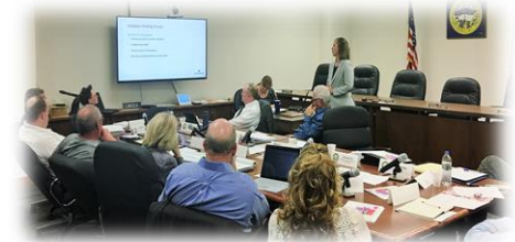
911 Service System Advisory Committee

During meetings held in April and May, newly retained consultant Mission Critical Partners (MCP) helped to map out next steps. Tops on the list, formation of working groups and leadership for the groups. A list of the working groups and their chairs can be found below. Working group guidelines were established and group kick-off meetings were held for the several working groups with first reports expected to be submitted to the Committee in July