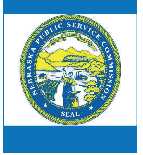
An online Publication of the Nebraska Public Service Commission State 911 Department