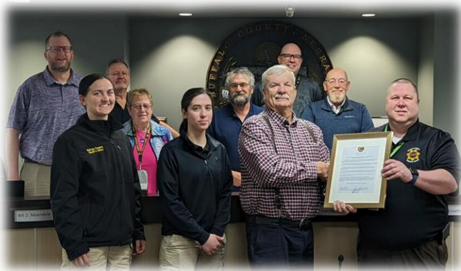
Buffalo County Board- NPSTW Proclamation