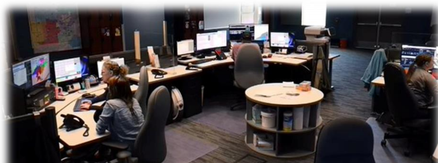
Grand Island/Hall County Emergency Management Dept. & 911 Dept. shared examples of the great work performed by their 911 dispatchers