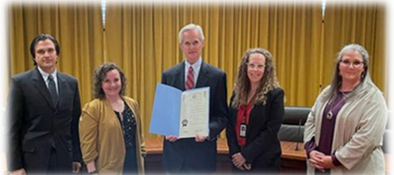
Governor's NPSTW Proclamation Signing

We saw lots of great social media posts. Here are just a few of the events and honorees we captured.