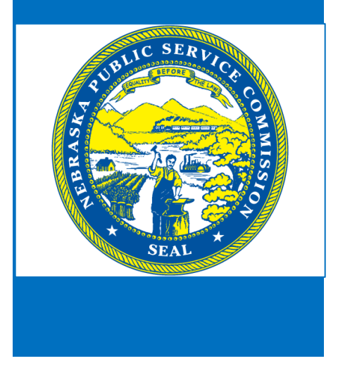
An online Publication of the Nebraska Public Service Commission State 911 Department