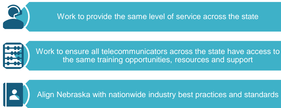
Figure 1: Goals of the Training Working Group