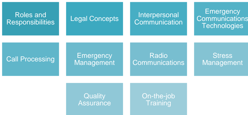
Figure 3: Minimum Training Guideline Topic Areas

Below are the minimum training requirement topic areas that shall be included in a public safety telecommunicator training program.