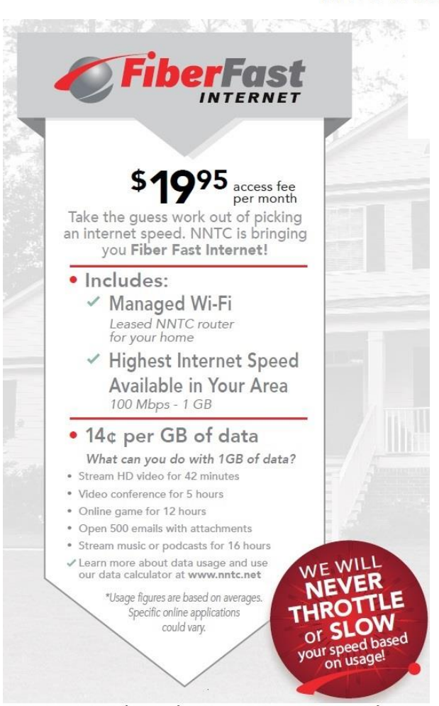
NNTC Residential Internet Pricing Brochure Sample